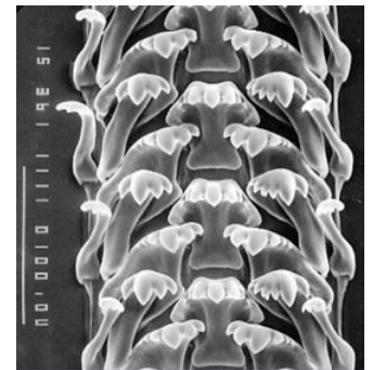
Sharp-pointed radula of Lacuna , feeding on kelps and algae