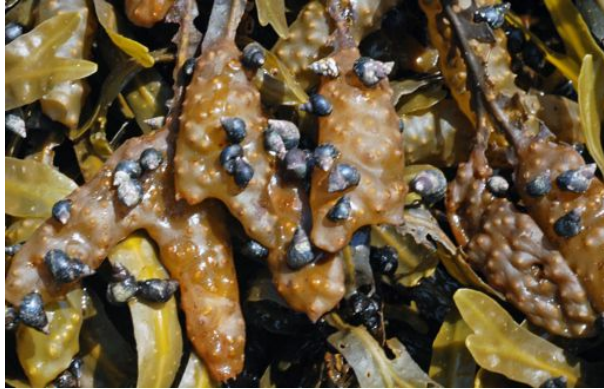
L. scutulata on intertidal rockweed, Fucus. Gerald Island, Strait of Georgia, B.C. July 2009.

Most Littorina and Lacuna species are found browsing directly on algae or seagrasses or grazing on the films of diatoms growing on the marine plants.