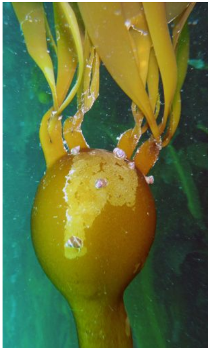
Nancy Elder, USGS, captured Lacuna vincta feeding on the surface layer of Bull kelp, Nereocystis leutkeana . Strait of Juan de Fuca, near Ediz Hook, Port Angeles, WA August 2009.

consume any macroalga (kelps, Ulva and other algae) and blunt-shaped teeth are produced in response to grazing response to grazing on epiphytes found on eelgrass. It may take as long as three weeks to produce new teeth in response to a changing diet and mismatches between Lacuna tooth morphologies and food type can result in lower consumption rates.