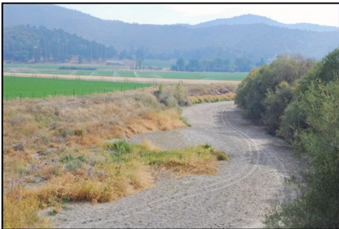
Fig. 3. The dry Scott River in 2014. Note vehicle tracks in the riverbed and fields being irrigated.

The Klamath River drainage had one of the most